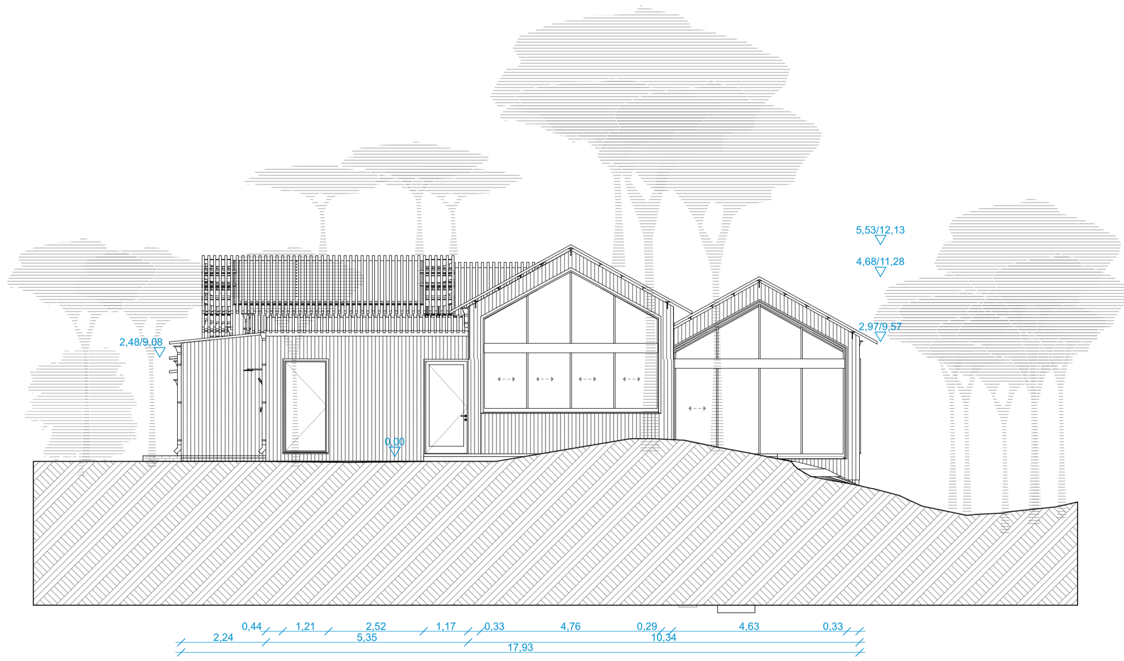
DE Façade Ouest