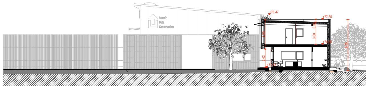
Coupe Transversale Atelier