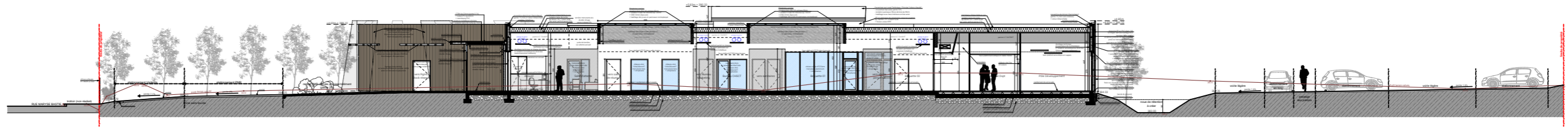
COUPE A5 sur terrain et construction - Ech.1/300