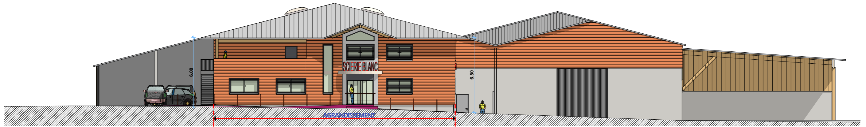
FACADE EST : ECH 1/200°