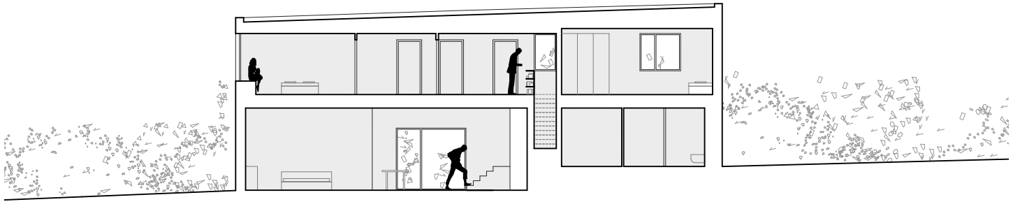
▲ coupe longitudinale A