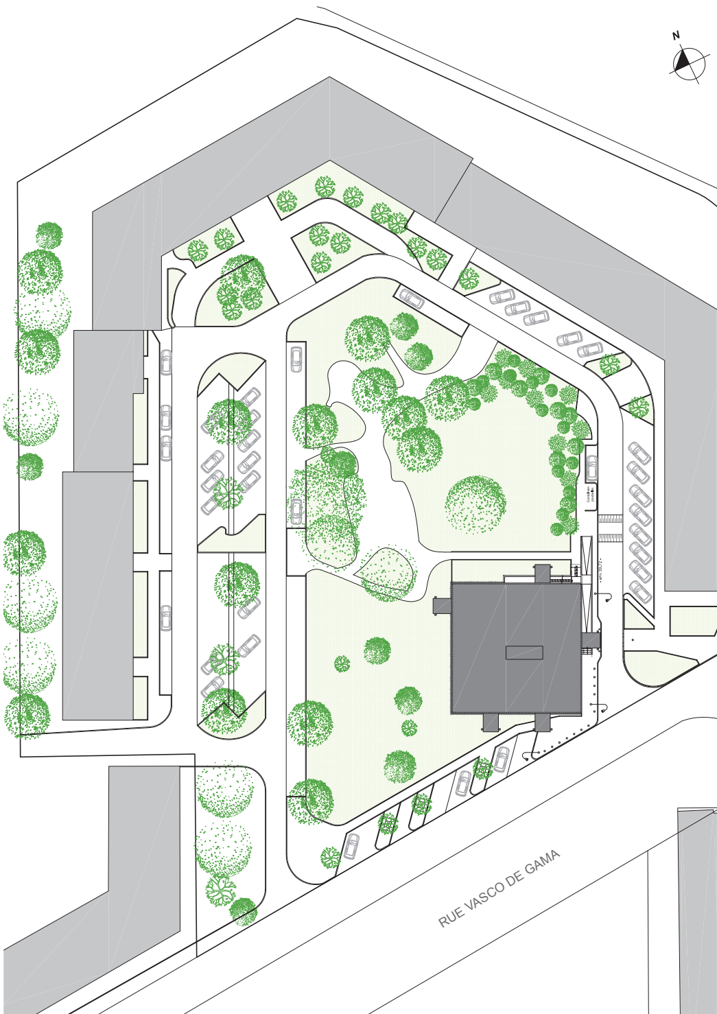
PLAN DE MASSE