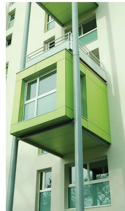
VUE SUR UN ORIEL